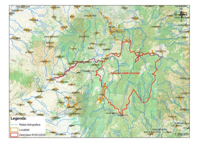
Figure 1 The geographic position of ROSCI0226 – Semenic Cheile Carasului site

This site is situated in south-west of the country, Caras-Severin county south, south-est of Resita town and along with ROSPA 0086 Semenic Mountains -Cheile Carasului site of National Park Semenic -Cheile Carasului . Geographically, the site is located at 48°8'7" N latitude, 21°25'34" E longitude and stretches on a surface of 37729.79 ha. Minimum altitude is 105 m, and maximum altitude 1445 m, also average altitude is 816 m. (Figure 1).